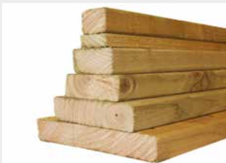
Treated & Untreated Sawn Timber in a range of sizes