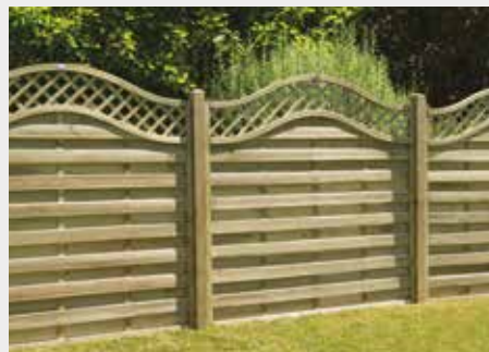
Traditional, Decorative and Acoustic Fence Panels