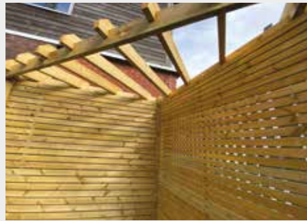
Treated & Untreated PAR