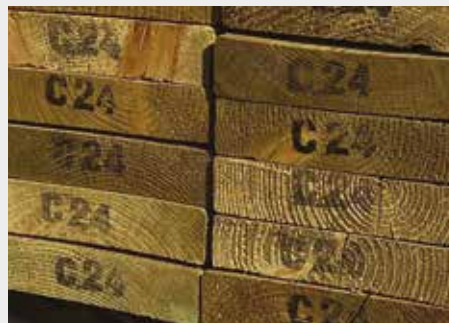
Graded & Ungraded Carcassing