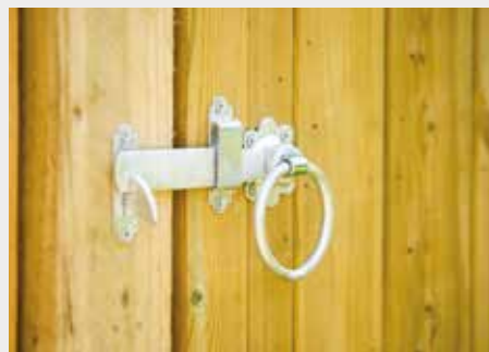
Gates & Gate Hardware