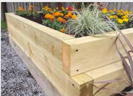
Softwood & Oak Sleepers