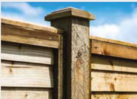
Fence & Gate Posts, Gravel Boards, Post Mix