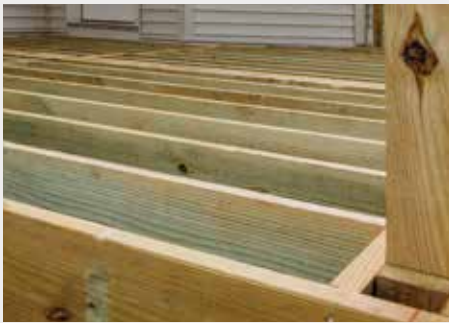
Decking Frame Timber